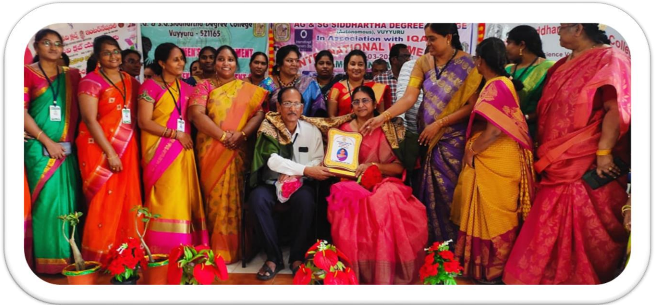
Felicitation to the Chief Guest

Conclusion: On this International Women’s Day, let us reaffirm our shared commitment to “leaving no one behind” and accelerating our efforts towards building a more secure, accessible, inclusive and equitable digital world for all of us and for women and girls in particular.