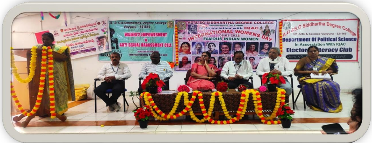
Introducing the Chief Guest